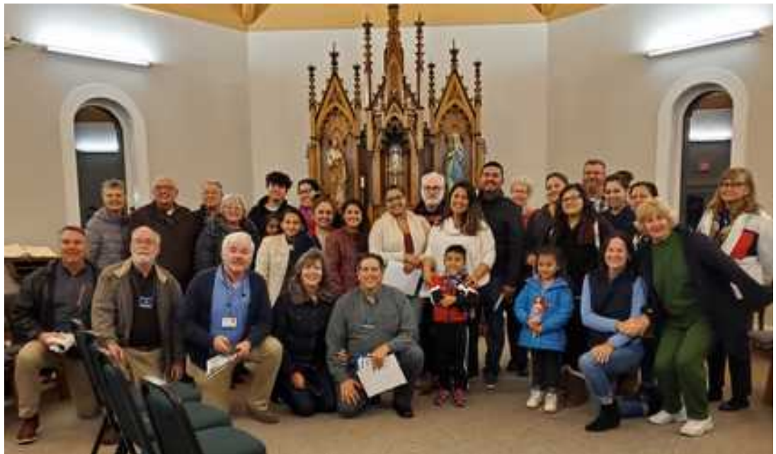
The Rosary Group in the St. Ann's Chapel